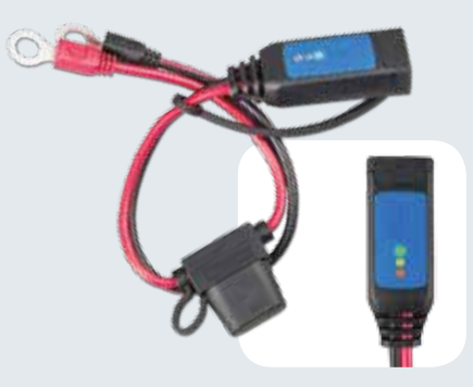
Battery indicator eyelet M8

Carry Case for Blue Smart IP65 Chargers and accessories