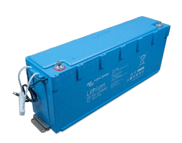
Secured with mounting brackets